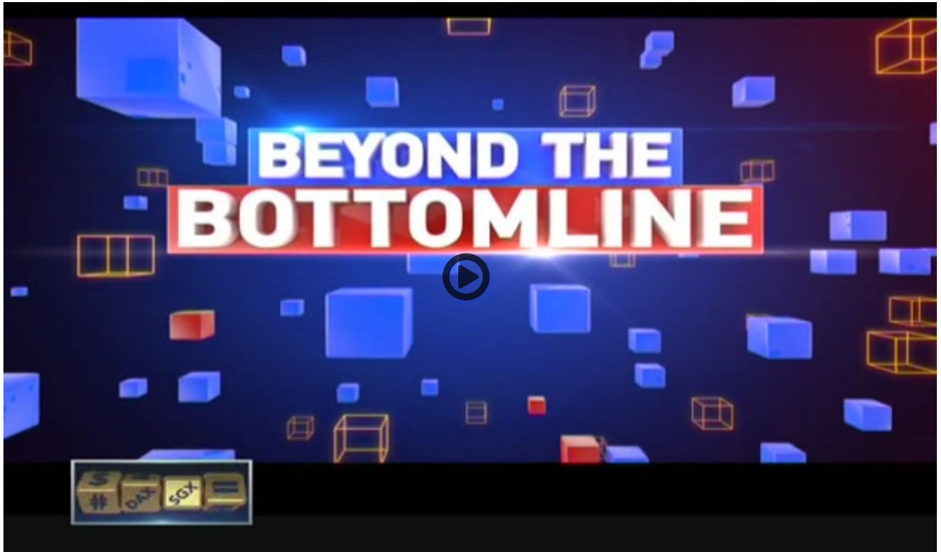
Kirloskar Brothers: Future Roadmap

(/videos/kirloskar-brothers--future-roadmap/32407)