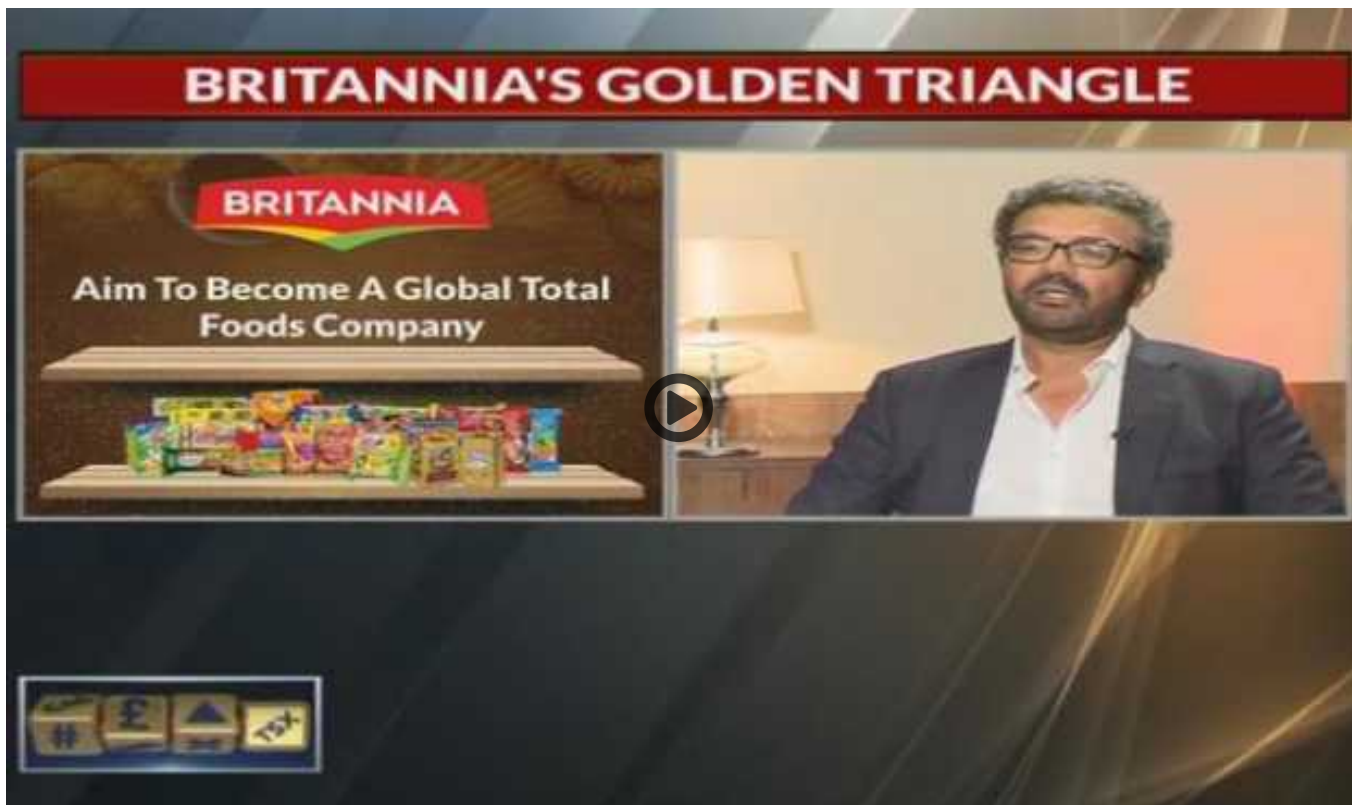
Innovation The Key To Britannia's Success Over 100 Yr Journey

(/videos/innovation-the-key-to-britannia-s-success-over-100-yr-journey/32370)