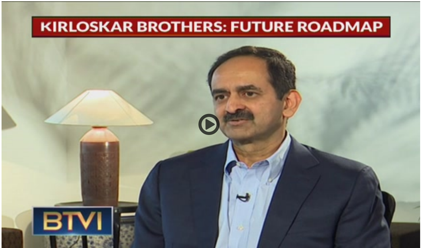
Kirloskar Brothers: Future Roadmap

(/videos/kirloskar-brothers--future-roadmap/32407)